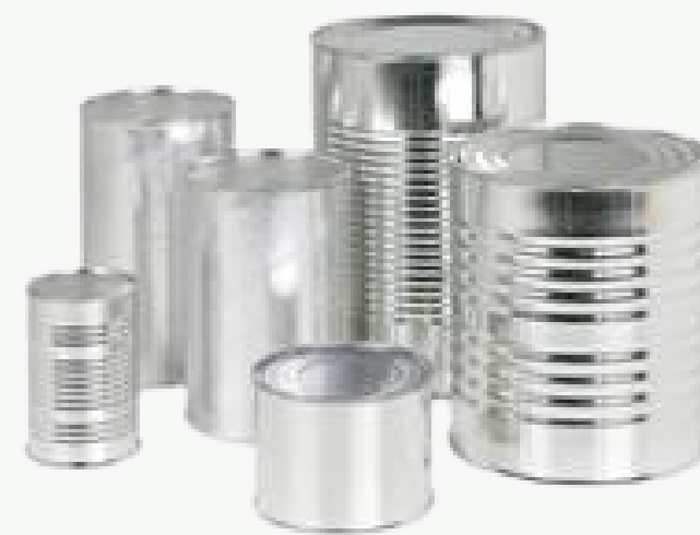
Aluminum & Tin Cans